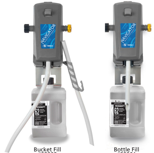
Bucket Fill #23202