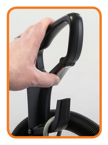
Quick cord clip for simple cord management