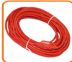
50 ft safety orange, detachable extension cord