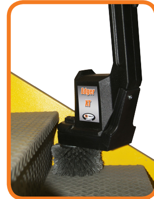
Optional Grit Brush to easily clean and strip stairs