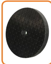
6 in pad driver